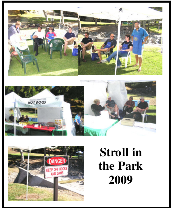
Stroll in the Park 2009