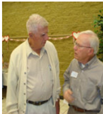
Two local authors visiting at a "Friend of the La Mirada Library" get-together